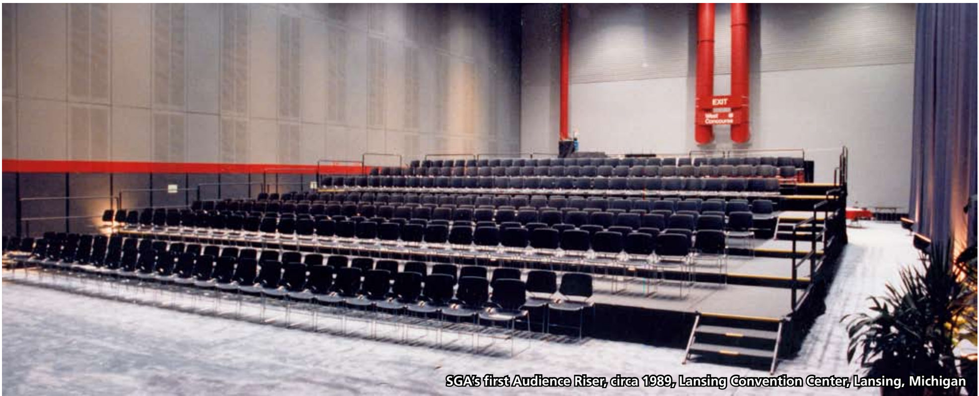
SGA's first Audience Riser, circa 1989, Lansing Convention Center, Lansing, Michigan